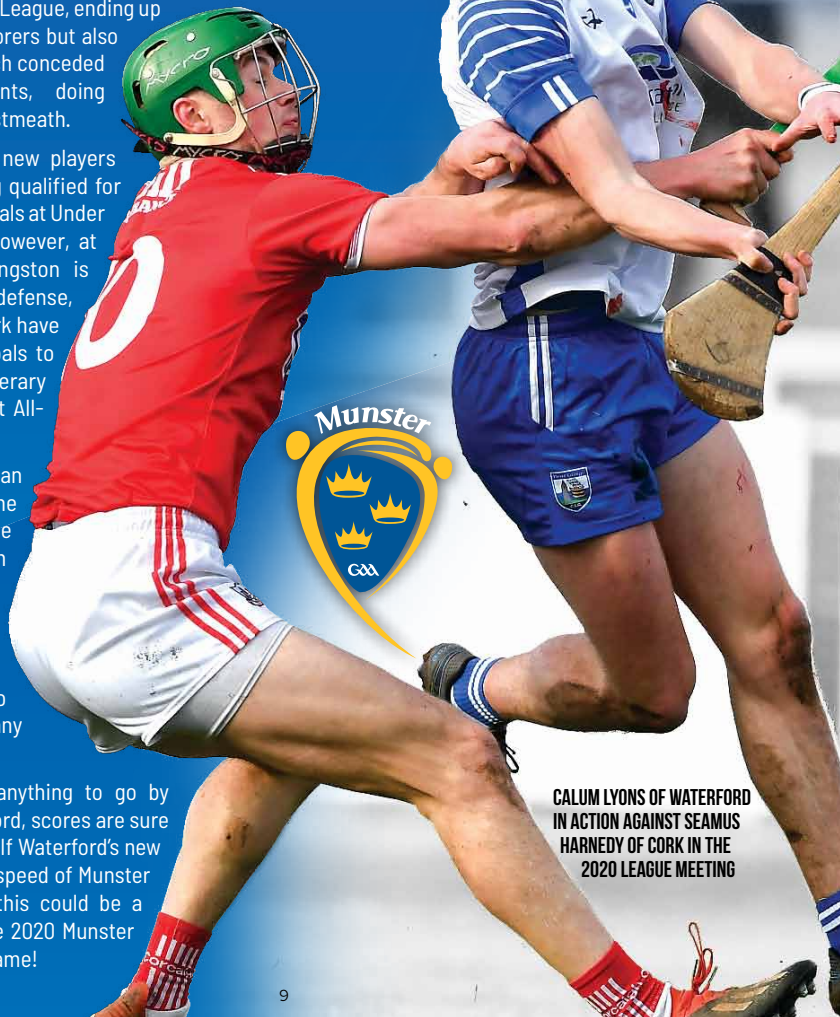
CALUM LYONS OF WATERFORD IN ACTION AGAINST SEAMUS HARNEDY OF CORK IN THE 2020 LEAGUE MEETING